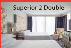
Superior 2 Double